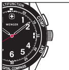
Position 1 (fully depressed)